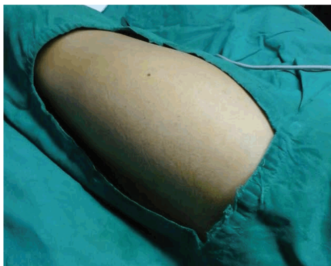
Figure 1: Protruding, mobile, painless mass seen in the left lower extremity (Left thigh) extending from ASIS to femoral epicondyle (Preoperative findings).