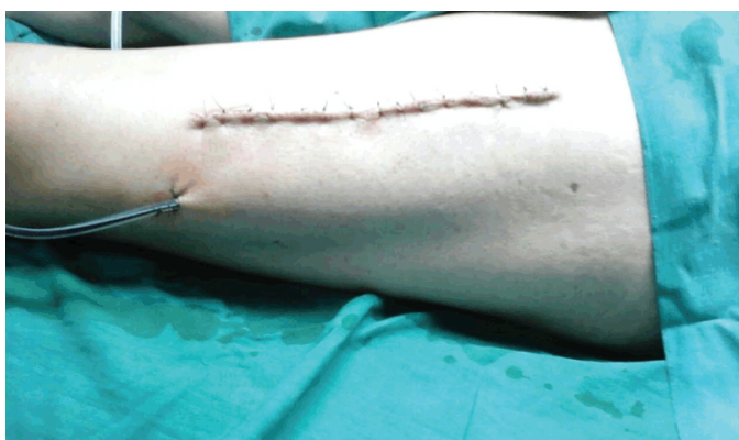
Figure 4: Post-Operative findings: Jackson Pratt (JP) drain that was removed after ten days.

Reported anatomical sites include joints, extra-dural with respect of spinal cord, breast, back and also other unusual locations like heart with or without septal involvement [1, 2, 3]. Numerous etiologies have been proposed for Lipoma. For instance, based on studies by Schoenmakers E. et al., aberrant genetic rearrangements on human chromosome 12 known as HMG1C have been known to cause solid benign lipomatous tumors [4]. In addition, hereditary conditions like Familial Multiple Lipomatosis have been known to present with multiple painless masses on trunk and extremities sparing the forehead with higher incidence in males as compared to females [5]. Other disorders include Dercum's disease [6] and Madelung's disease [7] with former being more commonly associated with obesity in post menopausal women and latter being associated with alcohol consumption. Lipomas can be characterized in several different ways [2]. These include solitary lipomas which are isolated, benign and well circumscribed, angiomyolipomas which are tender subcutaneous masses which are somewhat firmer as opposed to the rubbery consistency and congenital diffuse lipomas which are composed of immature fat cells that occur on trunk and back. In addition, if lipomas are larger than ten cm, liposarcoma needs to be ruled out by ensuring lack of associated symptoms like weight loss [8].